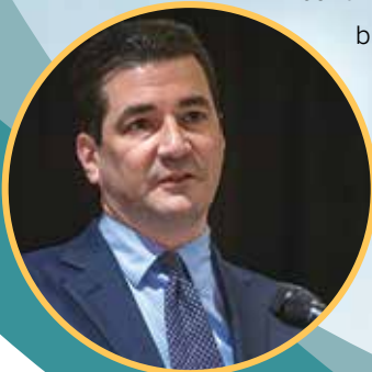
➤ FDA Commissioner Gottlieb congratulates award winners

Celebrating the progress and the promise of regulatory science, the Foundation hosted its second Innovations in Regulatory Science Awards dinner on December 4, 2018. Two hundred people from government, academia, industry, and patient advocacy gathered to recognize the extraordinary contributions of the honorees in helping patients build better lives through regulatory science. The Foundation hopes that honoring today's change-makers will also inspire the next generation of researchers, innovators, and regulators.