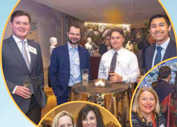
➤ Attendees celebrate at the 2018 Innovations in Regulatory Science Awards Dinner