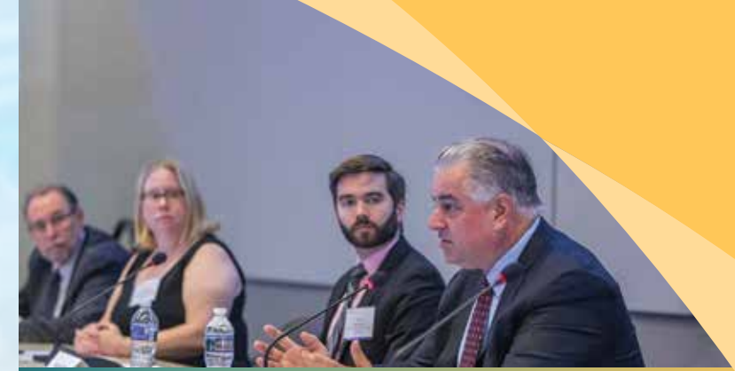
➤ Sharing patient, physician, and bioethics perspectives

The meeting report is being shared with FDA and broadly disseminated to stakeholders, including patient groups and the biopharmaceutical industry, with the intention of implementing data strategies and encouraging participation in pilot studies to identify best practices for expanded access data collection.