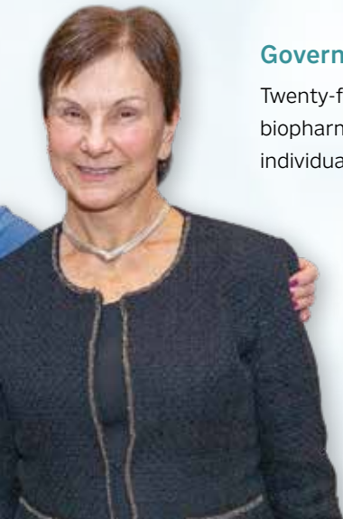
Former Foundation Executive Director welcomes attendees