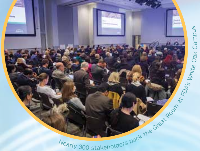
Nearly 300 stakeholders pack the Great Room at FDA's White Oak Campus