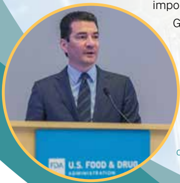
➤ Commissioner Gottlieb discusses real-world evidence