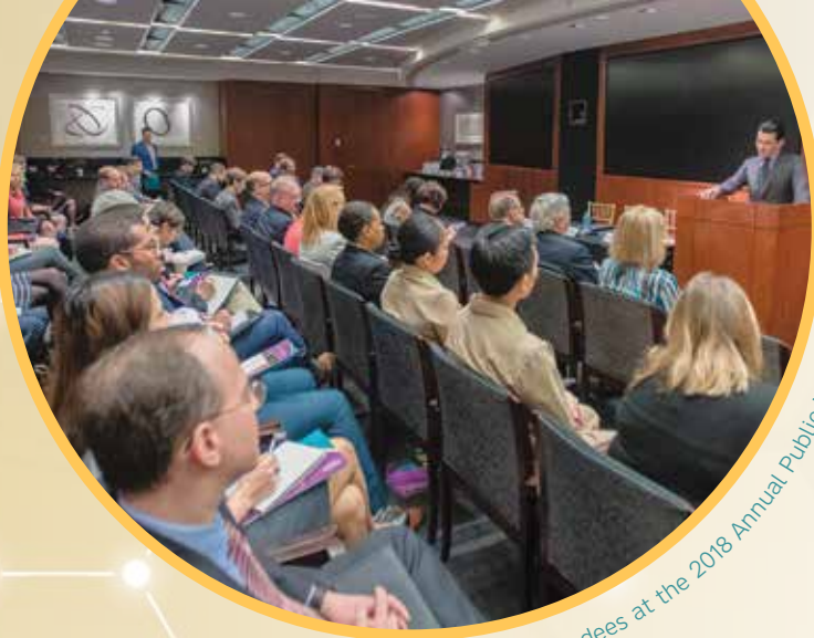
Attendees at the 2018 Annual Public Meeting focus on FDA priorities