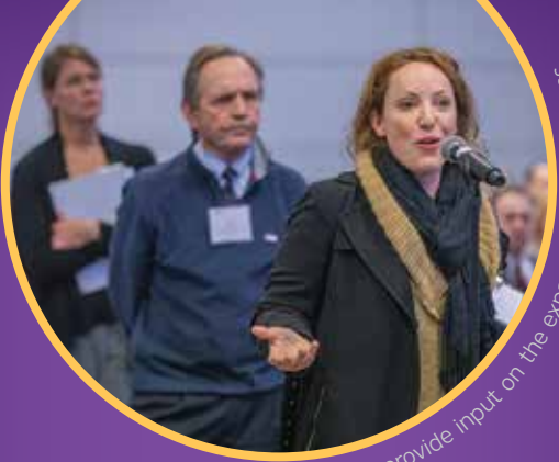
Stakeholders provide input on the expanded access process