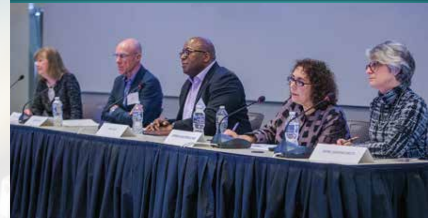
➤ Industry panelists discuss how they use expanded access data