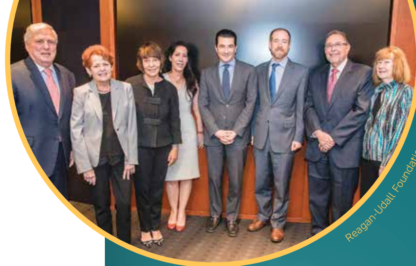
Reagan-Udall Foundation for the FDA Leadership

The Reagan-Udall Foundation for the FDA could not support the mission of the Food and Drug Administration without the assistance of a diverse Board of Directors. The bi-partisan legislation that created the Foundation required that the board represent a cross-section of academic research, patient and consumer advocacy, health care providers, and regulated industry.